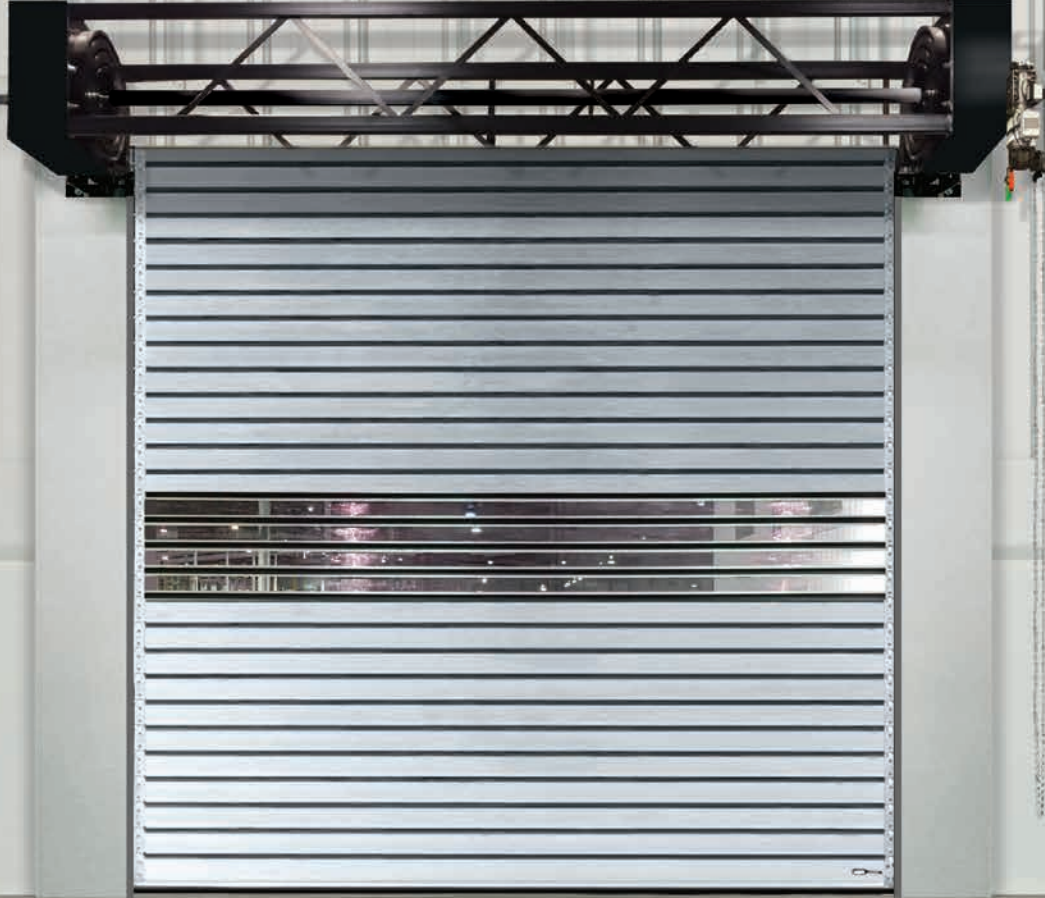
RapidShield® Model 998 with optional vision slats