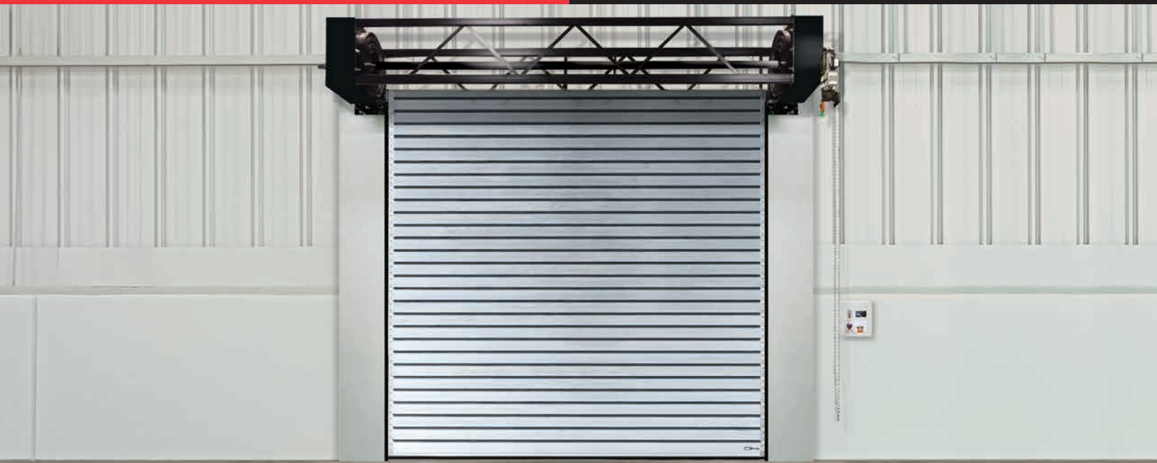
RapidShield® Model 998