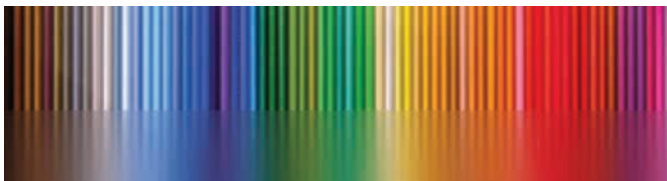
Approximately 200 RAL powder coat finishes available on all pieces.